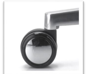
Chromed soft band wheels